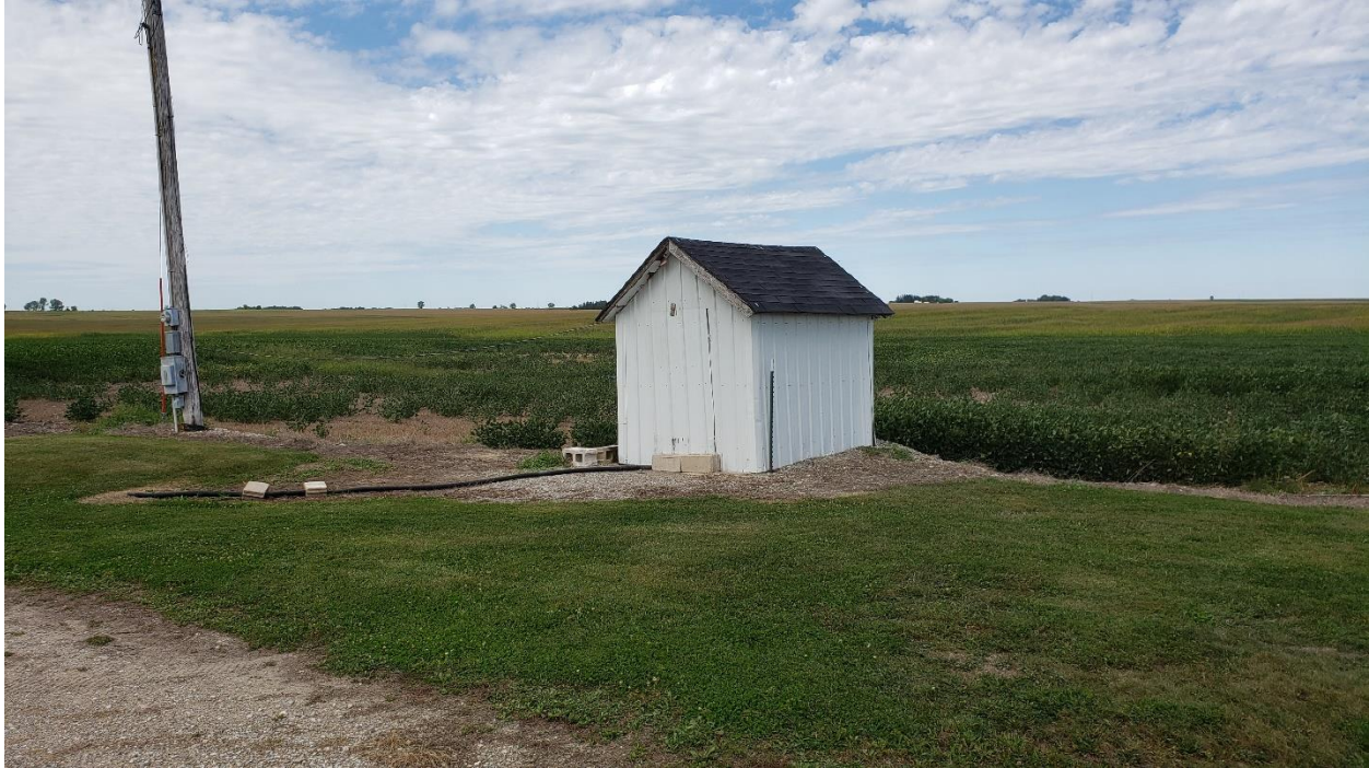
Figure 3 Looking at the existing wellhouse