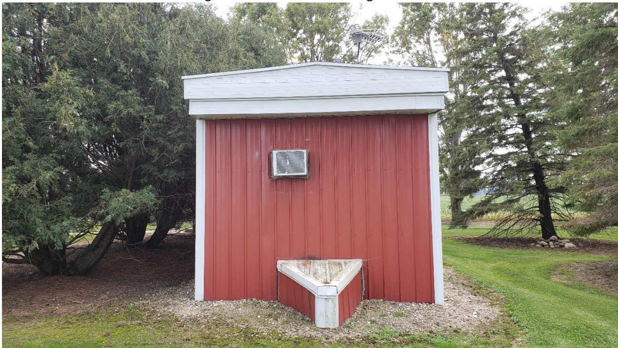
Figure 4 Looking at the width of the existing mobile home