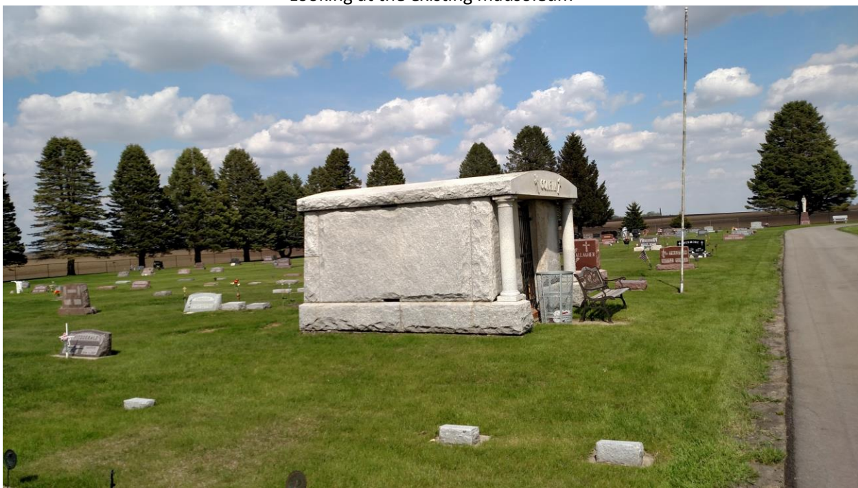
Figure 3 Looking at the existing mausoleum