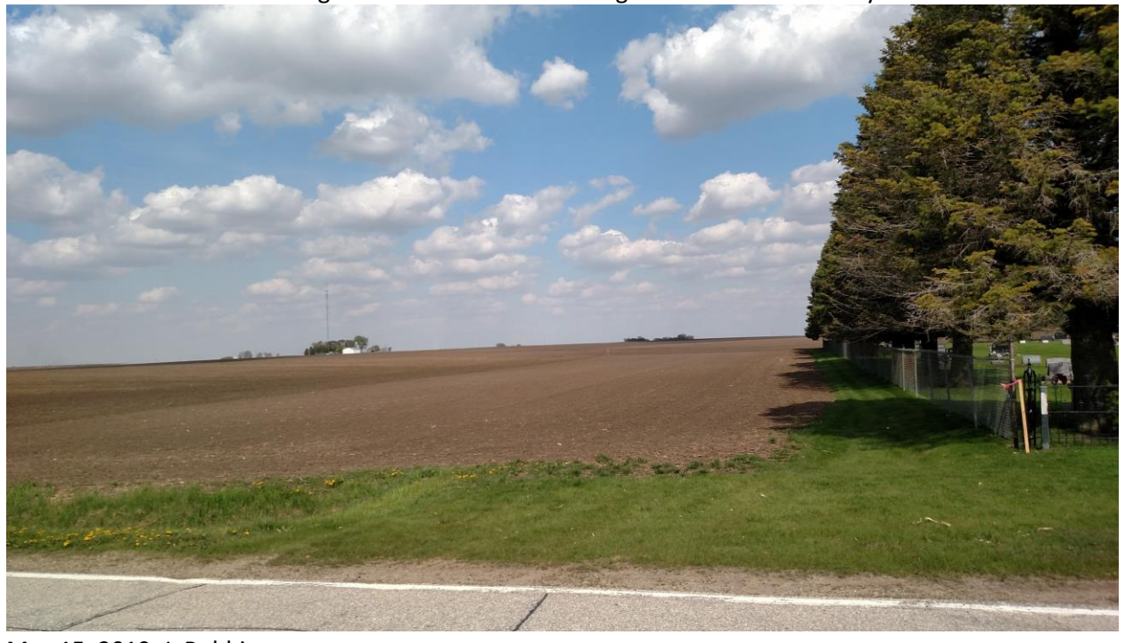
Figure 2 Looking at the additional land being added to the cemetery