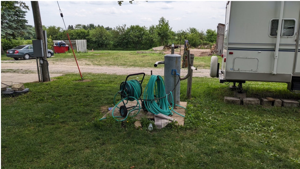
Figure 18 Looking at the onsite well