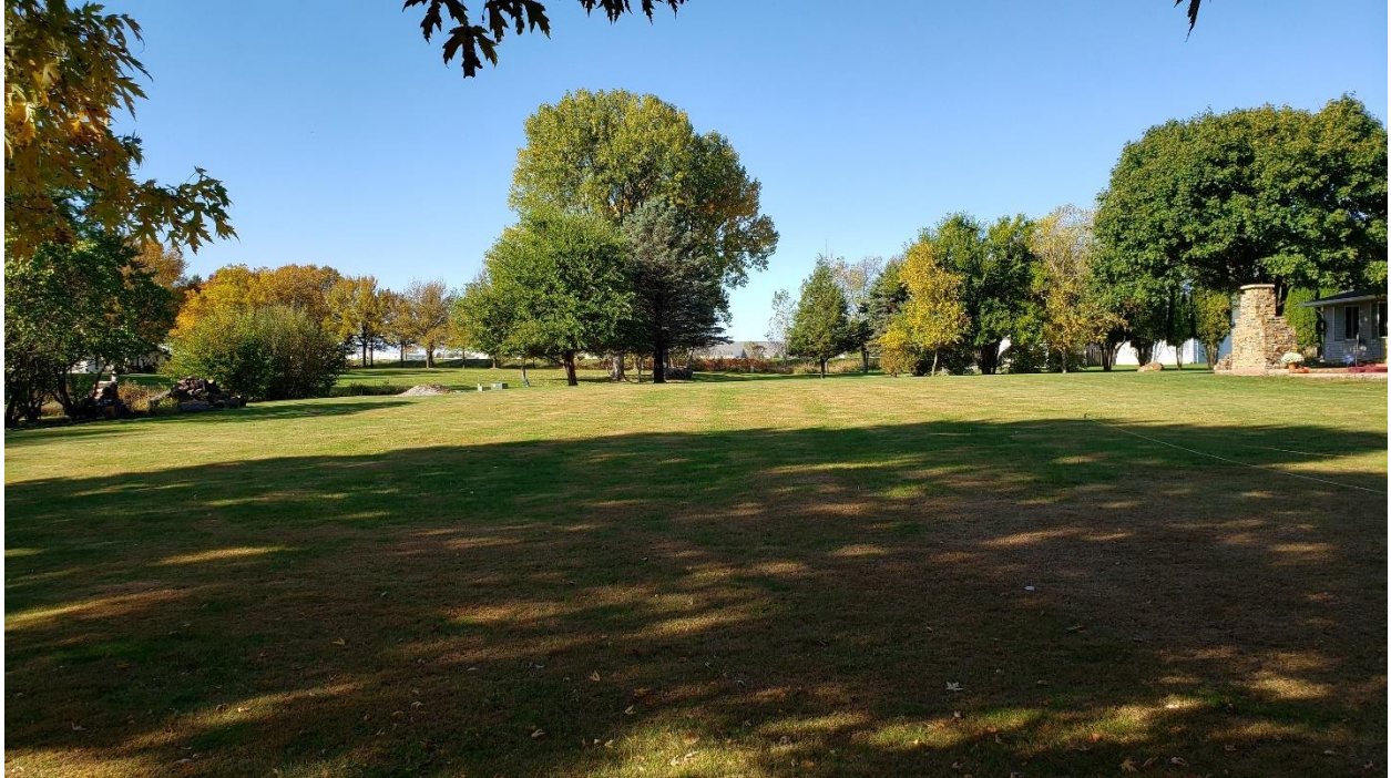
Figure 5 Looking at the rear yard of the property