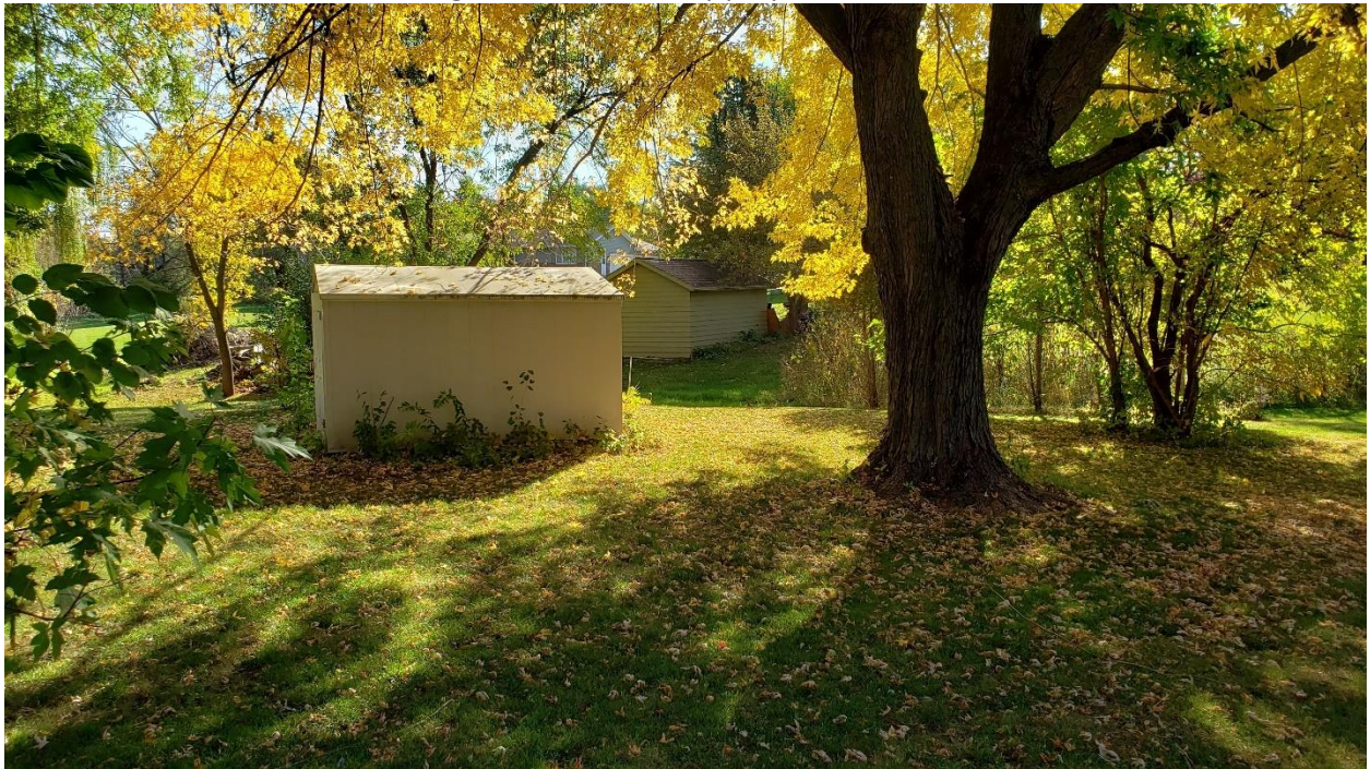
Figure 6 Looking at sheds on nearby properties to the east