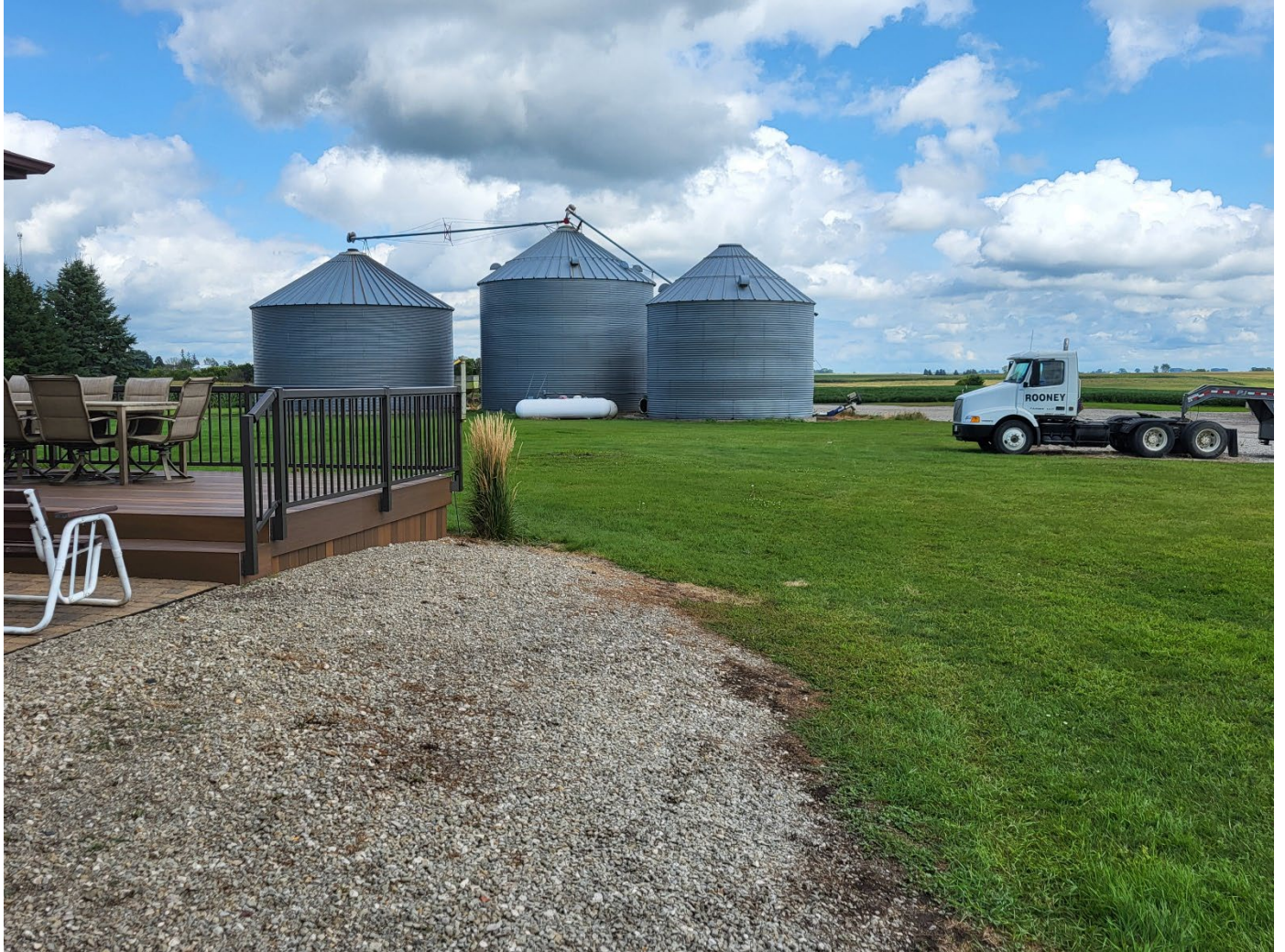
Figure 2 Looking at the grain bins