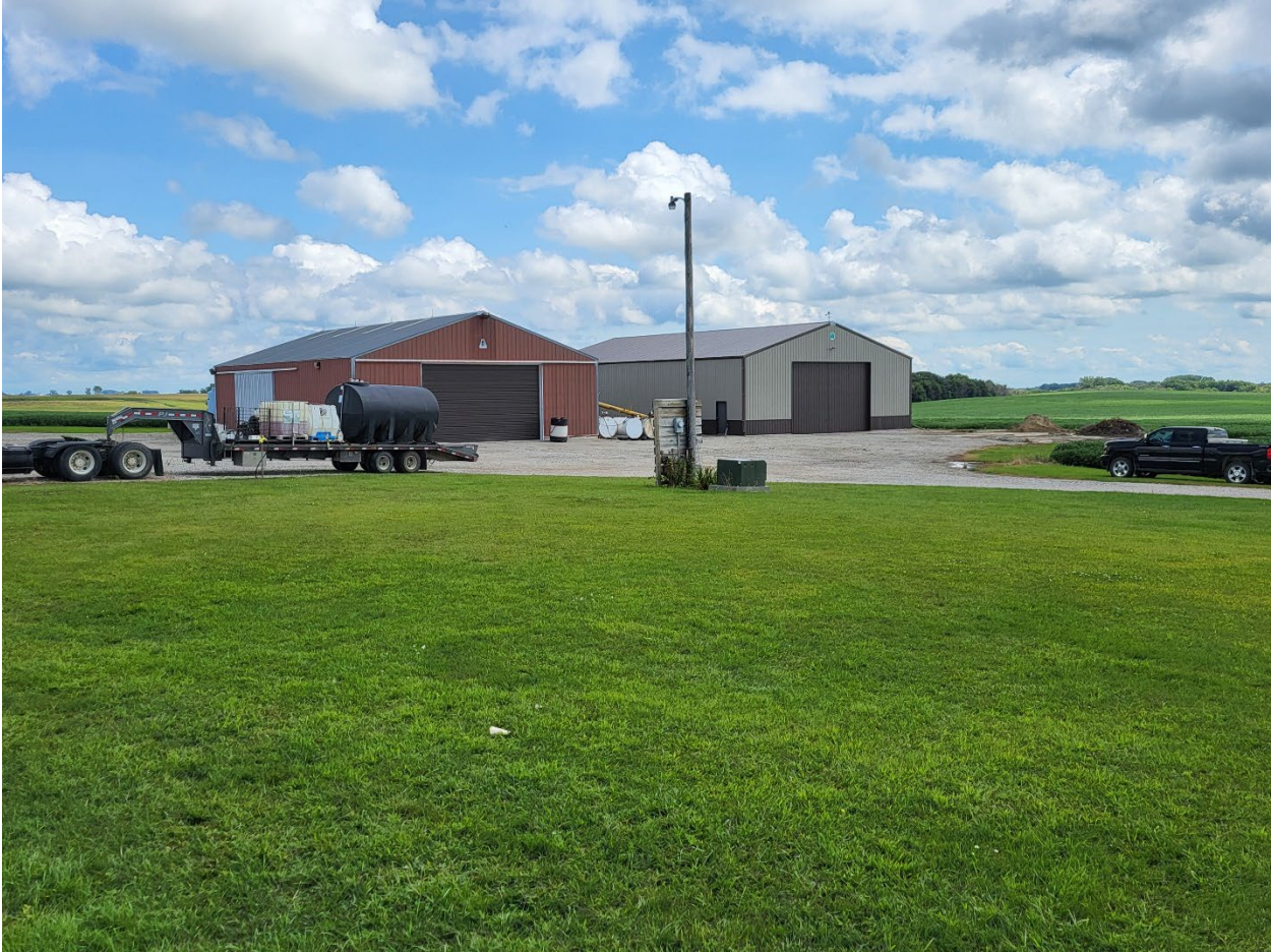
August 2024