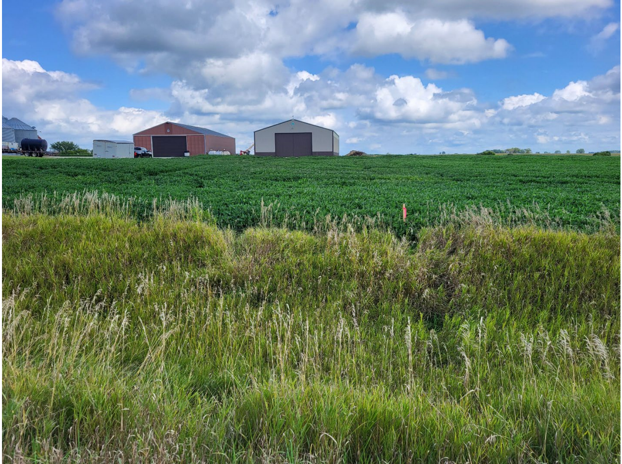
Figure 4 Looking at South lot line marker